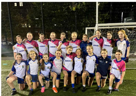
Last game of the season vs Davitts 21/10/24