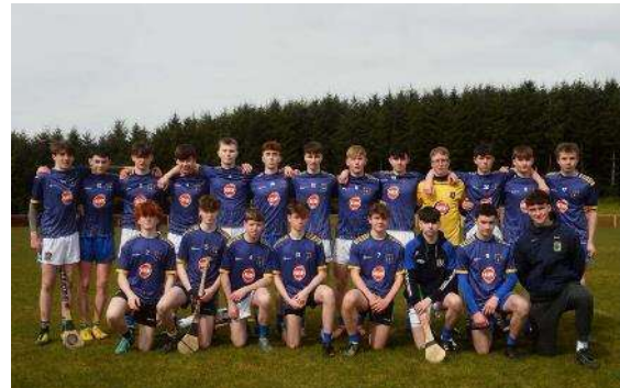
Ard na Rí Squad v Rossa

At the start of the year the panel looked strong enough to challenge well in Division 1. The league opened on 3rd May with a game against Rossa played at Hannahstown. A very tight first half closed with two points between the teams but Rossa pulled away decisively in the second half.