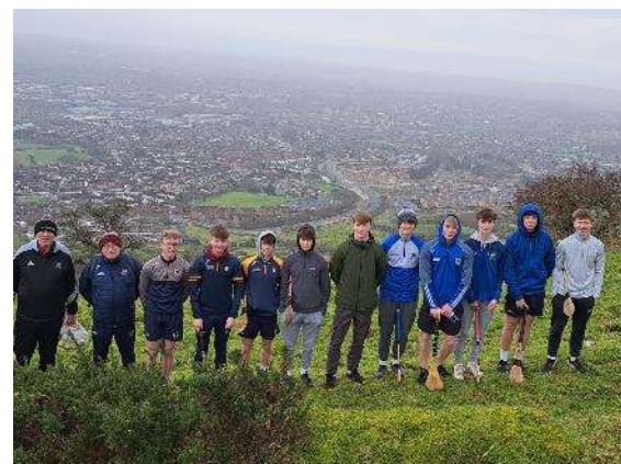
Break in Pre Season Training on Black Mountain

In late April we were able to move training to Musgrave Park.