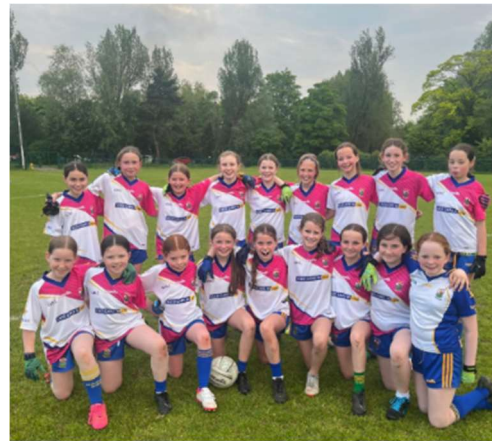
Home Blitz 17/05/24