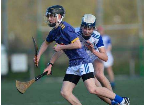
Cuan carries the sliotar through a Cavan tackle