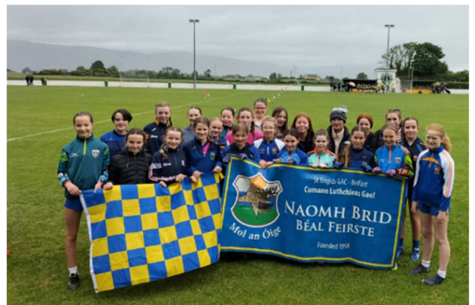
Cooley Tournament 09/06/24